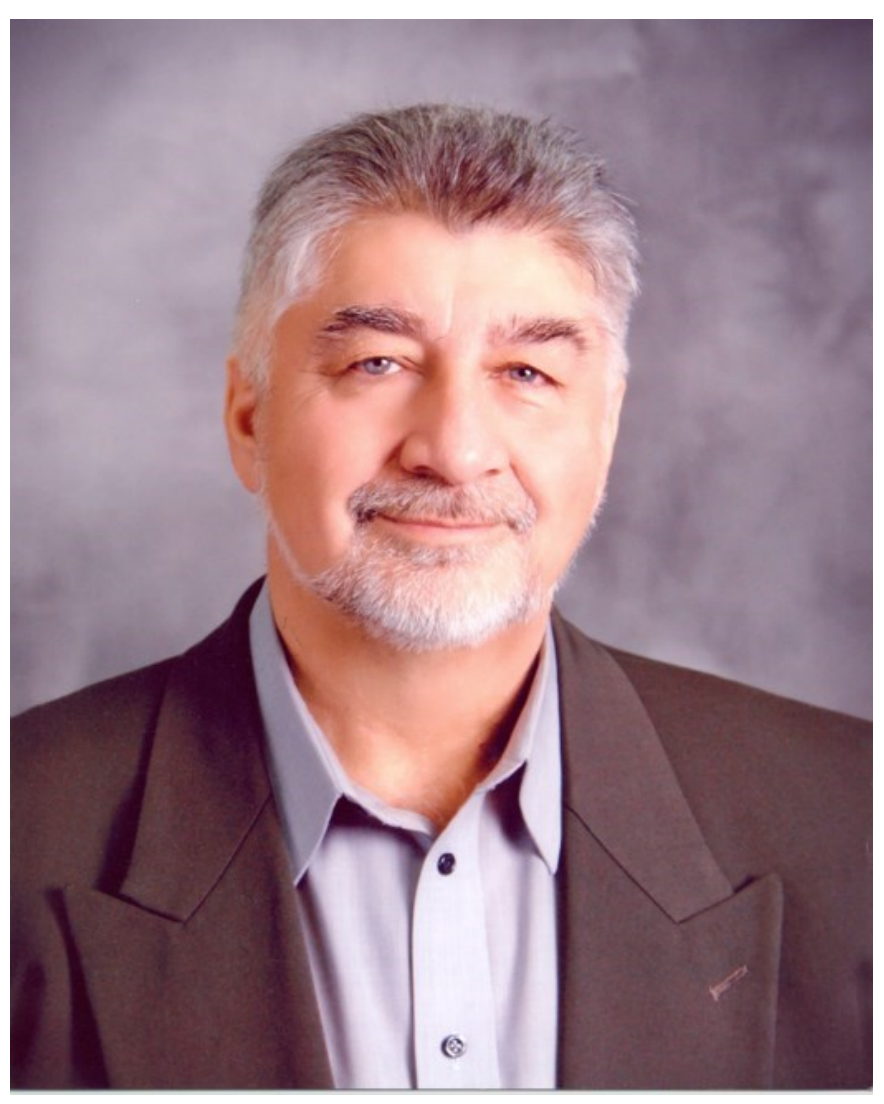
Central Lutheran Church Yakima, WA Saturday, May 22, 2021